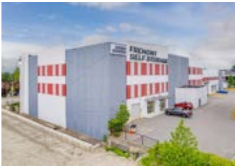
PORT COQUITLAM, BC