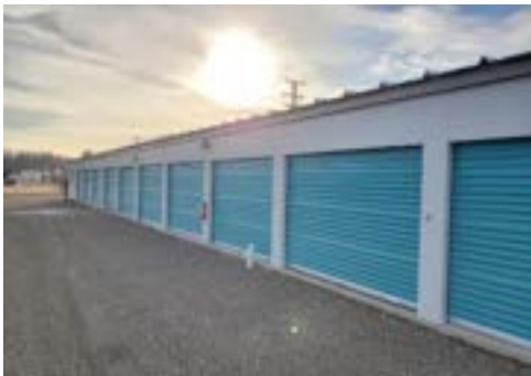
PRINCE GEORGE, BC