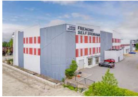
PORT COQUITLAM, BC