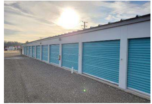
PRINCE GEORGE, BC